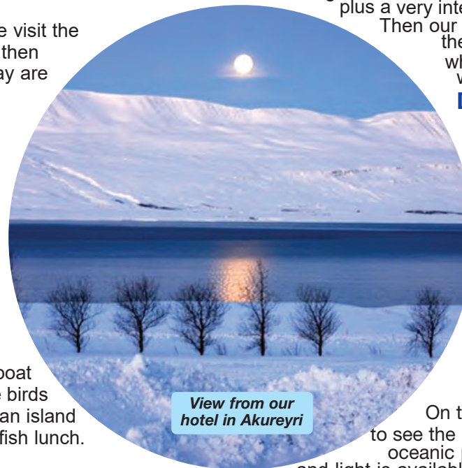
View from our hotel in Akureyri

After departing from our hotel we visit the Settlement Centre Museum, we then journey northwest, (along the way are many beautiful stops for photography), and travel on towards our destination, Akureyri, the capital of the North where we will be staying for two nights at the beautifully situated Country Hotel. At the hotel we enjoy a Buffet Dinner.